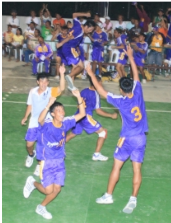
CRAA Volleyball team ‘shouts for joy’ after beating the National Capital Region at STEFTI Gymnasium.

The Cotabato region also kneeled down the teams of Cordillera Autonomous Region and Ilocos Region the other day. (AMS)